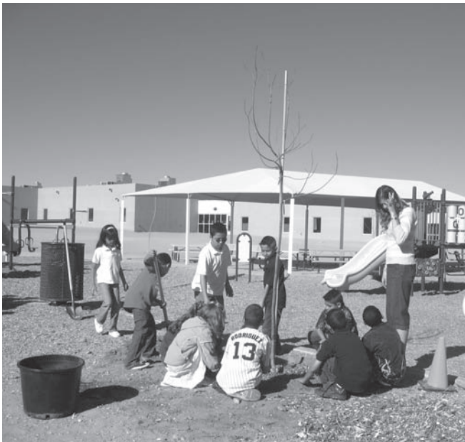
Vista Grande Elementary School students participate in tree planting activity as part of Clean Campus Contest winners!

Keep Rio Rancho Beautiful will host the 12 th Annual Clean Campus Contest from March 7 through April 18. Participating schools will receive curriculum guides and activities for students that promote responsible waste management and stewardship for the environment. A volunteer panel will judge the schools on their litter-free, recycling, and beautification efforts. To register your school, contact KRRB at 896-8729.